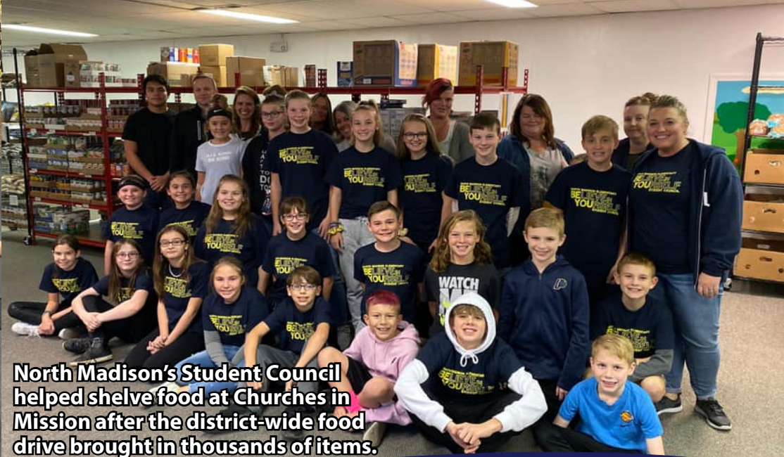
North Madison's Student Council helped shelf food at Churches in Mission after the district-wide food drive brought in thousands of items.