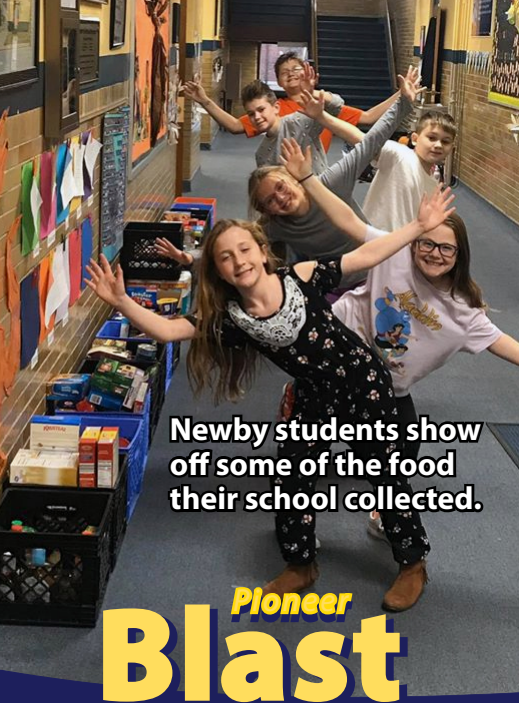
Newby students show off some of the food their school collected.