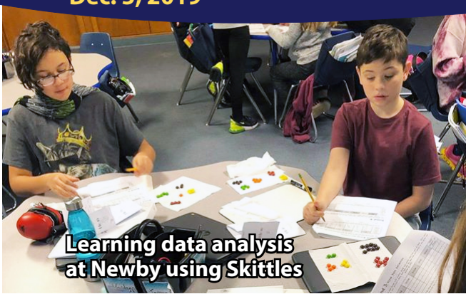
Learning data analysis at Newby using Skittles