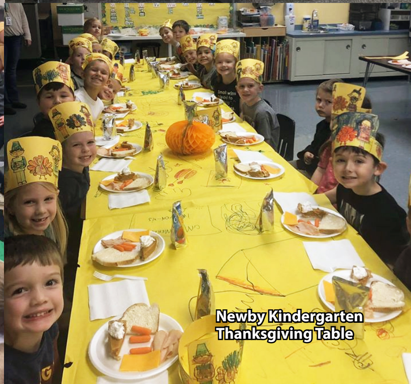
Newby Kindergarten Thanksgiving Table