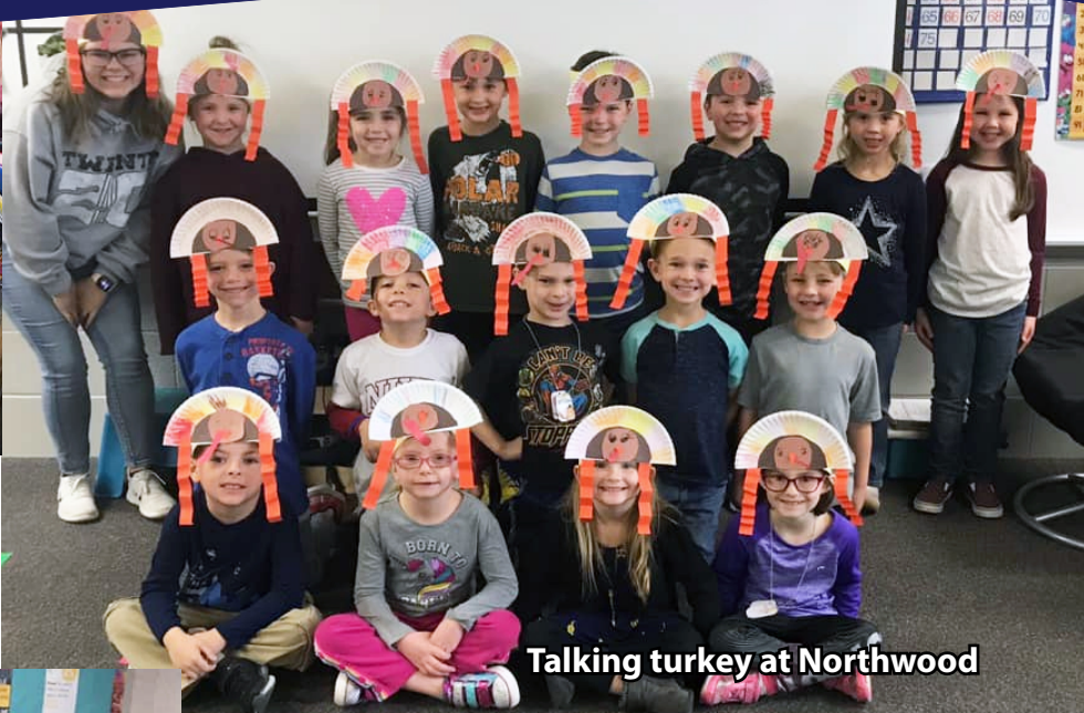
Talking turkey at Northwood