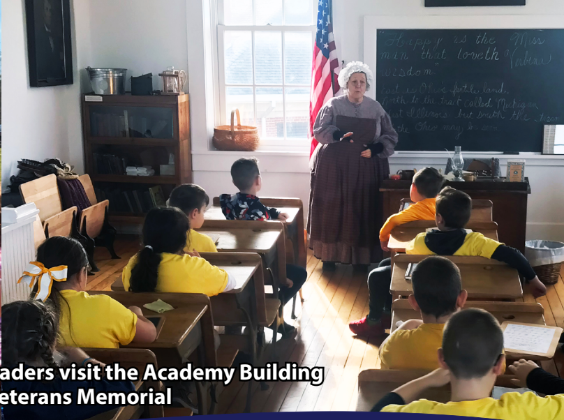
Northwood 4th graders visit the Academy Building and Mooresville Veterans Memorial